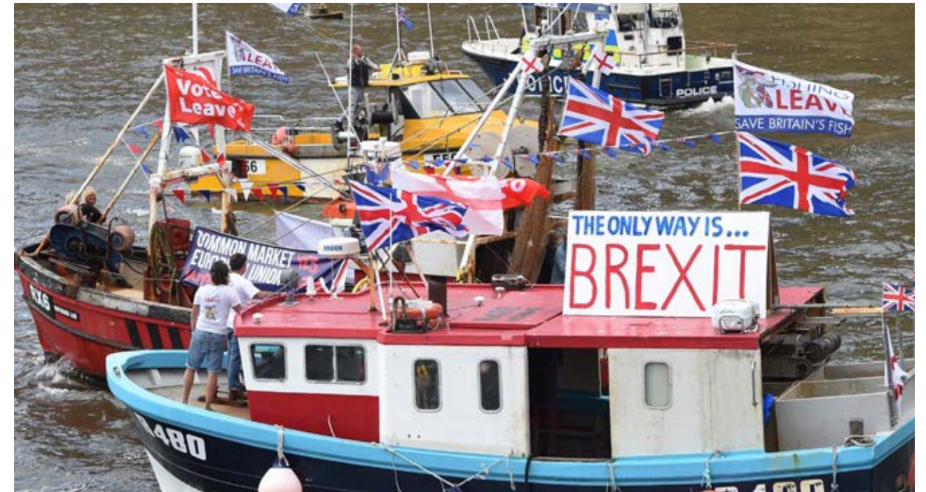
■ Pro-Brexit fishing trawlers sailed up the River Thames, London.

But it would not be correct to conclude from this that the new